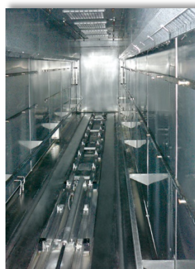
Fig. 5 – TCI