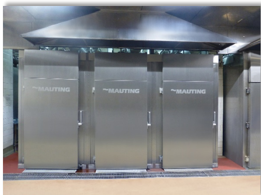
Fig.3 – Smoking chamber UKM 2004.E 3 x

Classic smoking chambers are the most successful products in the smoking chambers model series, their sales are increasing year after year and are successfully sold worldwide.