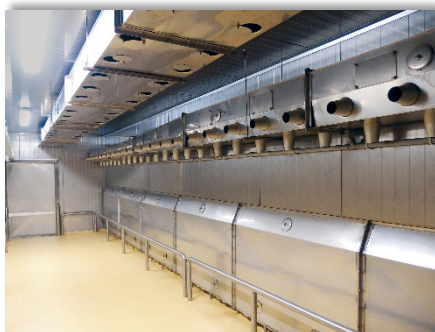
Fig.2 – Air conditioned chamber KMZ 20 DAF 2

Another example are the channels of the airflow system DAF 2 in climatic chambers. The system consists of alternating the phases of the vertical and horizontal flow direction of the incoming air. The amount of air from the left and right sides is continuously changed (Fig. 2). The system of alternating phases of the vertical and horizontal direction of flow of the incoming air ensures alternation of intensive flow through all the places in the chamber. This achieves even machining without dead spots and accelerates the entire drying process by up to 20% depending on the type of product. At the same time, this system reduces the risk of products ringing. The 10.4 "PPC21000 touch-screen control unit features Mauting's unique know-how in the area of climate control. The control works on the principle of absolute humidity using the enthalpy of the outside air. It enables precise chamber parameter control with a wide range of settings as well as remote access for control, diagnostics and data archiving.