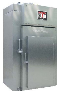
Fig. 7 – Smoking chamber UKM Compact

Among the novelties of MAUTING will be introduced the universal climate mini-chamber KMU MINI (Fig. 8). The chamber is versatile and meets the conditions for the machining of most commonly produced durable products, both heat treated and untreated. The chamber is also suitable for the production of moulded products, prosciutto or other dried meats. Glass doors with LED interior lighting provide an attractive view of the workpiece (suitable for shops).