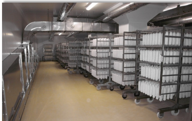
Fig. 1 – Air conditioned chamber KMD 150 CrossFlow

One of the exhibits which MAUTING will present at the IFFA exhibition is the most sophisticated airflow system in the CrossFlow climate chamber. The system is based on the possibility of alternating air flow, which increases the uniformity of the machining and reduces the risk of over-drying. As a result, the process can be safely accelerated by up to 20%. The chamber is always designed according to specific customer requirements (Fig. 1). KMD CrossFlow ripening climate chambers are especially suitable where there is a high demand for standardized products at the outlet of the chamber and also for products that achieve high average losses of 2-3% / 24 hours. They are designed primarily for larger chambers with a width of more than 6 carts side by side. High performance chambers equipped with CrossFlow are undoubtedly an example of a sophisticated investment in quality equipment that has been successfully proven worldwide from the Russian market to America.