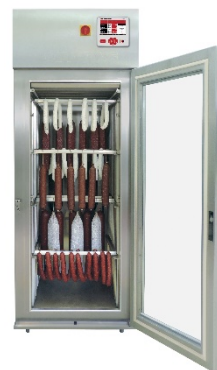
Fig. 8 – KMU MINI