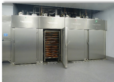
Fig. 4 – Smoking chamber UKMH 2003.E 4 x

Smokehouse and chilling chamber UKM / ZKM with the cart transport system (combined heat treatment set TCI, (Fig. 5) will be presented to the visitors of the MAUTING stand, which ensures automatic storage in the smokehouse, automatic transfer from smokehouse to the chilling chamber and automatic removal of the cart from the chilling chamber. Moreover, in contrast to the previous version, the transport system operates in both directions, i.e. that both sections can process the products independently of each other, including the storage and unloading of the chambers, but they can also work together with the transfer of trolleys from UKM to ZKM. The transport system operates using a hydraulic drive with a double-carrier system for precise movement. On this chamber, we will introduce a new straight design of SMART smokehouses with pneumatic door locks and concealed hinges and a guillotine door on the cooling chambers section. The device will have a glazed side for illustrative operation of the transport system.