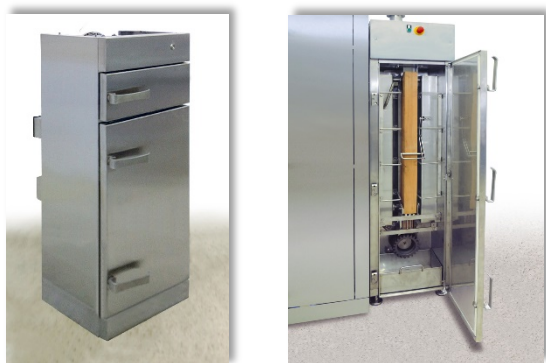
Fig.6 – Smoke generators MAUTING

Smoke chambers are always equipped with a smoke generator. The customer can choose between chip, friction, steam and liquid smoke applicators. The most popular is a wood chip smoke generator, where smoke is produced by smouldering wood crushed material on a special grate. The control system controls both the combustion temperature and the smoke, and thanks to the precisely controlled air supply below and above the grate, the generator operates even under changing conditions. The generator is available in several sizes, with 01, 02 and 04 types on the IFFA stand (Fig. 6).